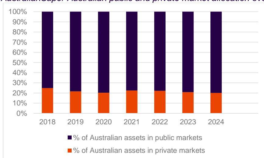
AustralianSuper Australian public and private market allocation over time