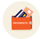
More money every fortnight