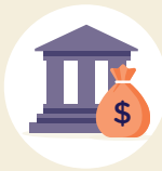
Government Age Pension