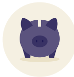
Account based pension - Choice Income account